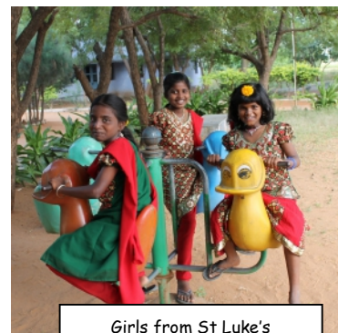
Girls from St Luke's enjoying themselves on the play equipment at the boys' home