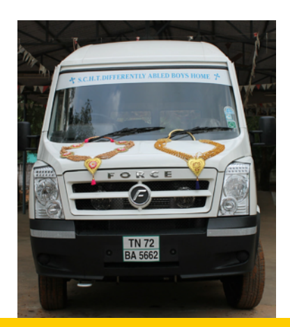
The new vehicle purchased by The Neem Tree Trust to take the children safely to and from school