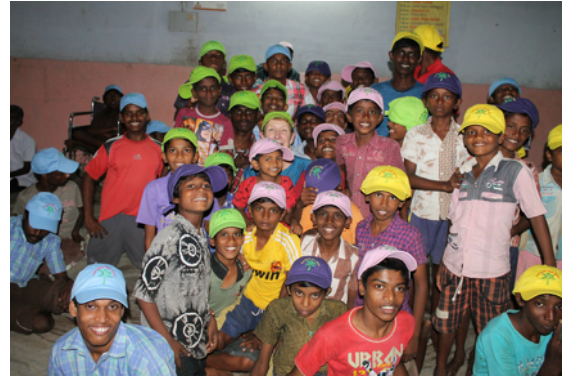
The Boys at the home sporting their Neem Tree Trust caps donated by ABR Co Ltd, Trowbridge

The above events generated just over £5,500.